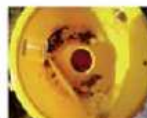
Catches: 65-75% females